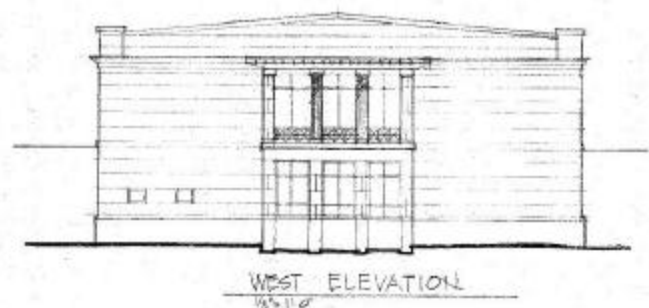
Details of Reynolds' drawings — two possibilities for developing the overlook pavilion (west view).