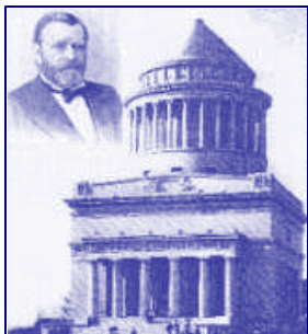
Grant Monument Association

Plus Special Insert: Invitation to Grant Birthday Ceremony