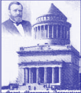
Grant Monument Association

Grant Monument Association P.O. Box 1088 FDR Station New York, NY 10150-1088